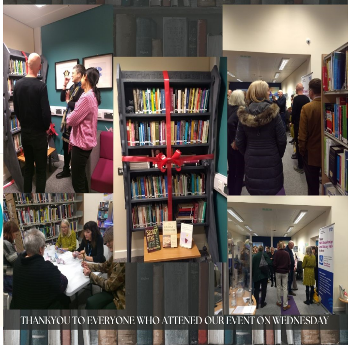
THANKYOU TO EVERYONE WHO ATTENED OUR EVENT ON WEDNESDAY

For any more information, support or queries regarding any resources in this newsletter please email: