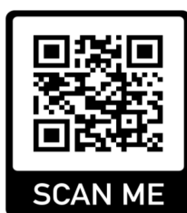
Royal Marsden Manual

All accessible with an Open Athens account. Sign up today: https://openathens.nice.org.uk/